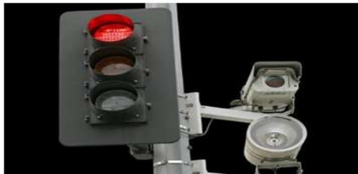
Figure 2: Cameras Installed On Red Light.